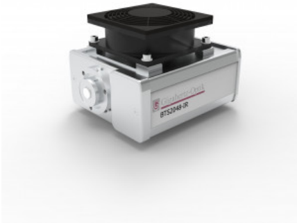
The BTS2048-IR spectroradiometer with thermoelectrically cooled array detector

One essential quality feature of photometric devices is their precise and traceable calibration. The BTS2048-IR is calibrated by Gigahertz-Optik's calibration laboratory that was accredited by DAkkS (D-K-15047-01-00) for the spectral responsivity and spectral irradiance according to ISO/IEC 17025. The calibration also included the corresponding accessory components. Every device is delivered with its respective calibration certificate.