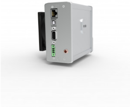
Cosine corrected diffuser and several trigger and I/O possibilities