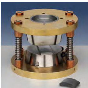
Segment pole caps