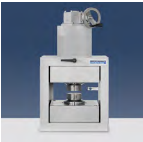
Electromagnet with heating poles

Measuring Technology for Soft Magnetic Materials Magnetizing Technology Services