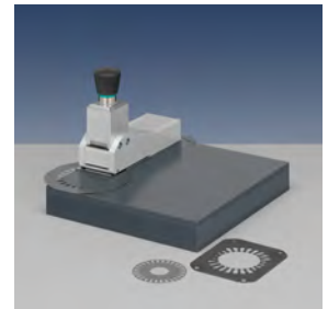
Punched part sensor