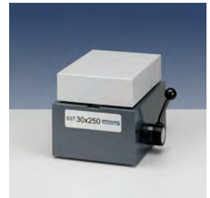
Strip measuring sensor